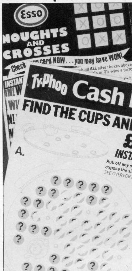
Losers: Esso and Typhoo got in trouble

There is a new phenomenon that also has to be considered, particularly in skill games. This is the emergence of professional competitors, syndicates and bureaux in the past two years or so. Many of their names are on Don Marketing's computer files and they operate in most parts of the country.