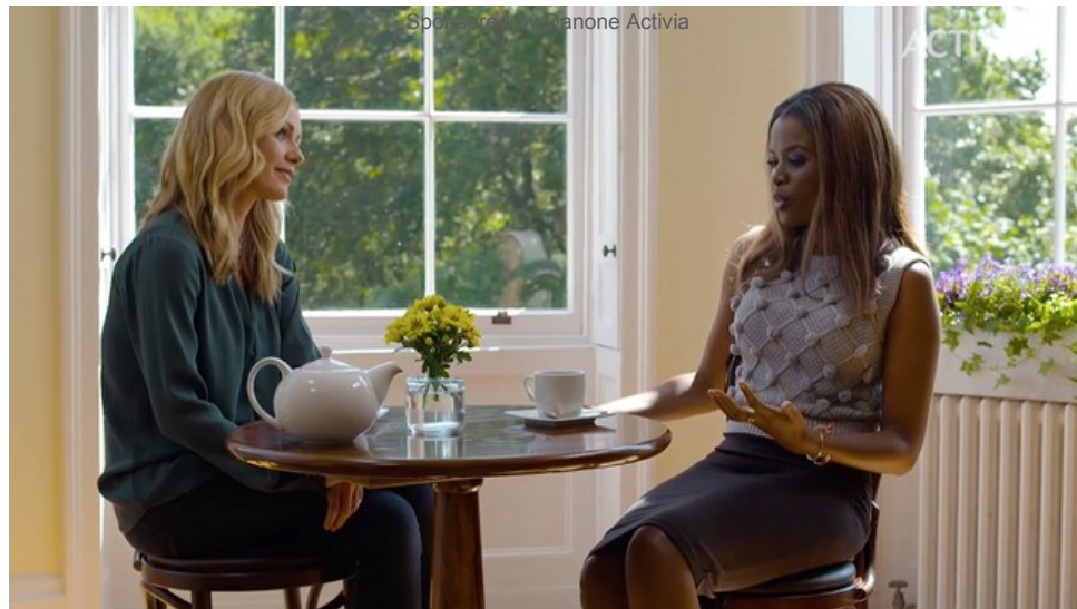
Katherine Jenkins meets June Sarpong